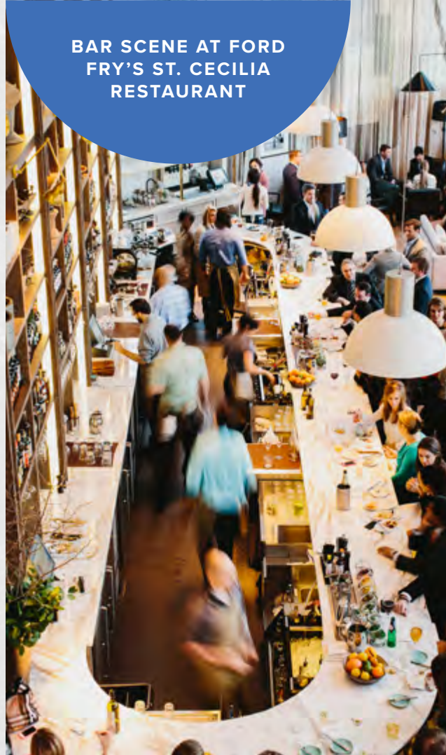
BAR SCENE AT FORD FRY'S ST. CECILIA RESTAURANT

The Pinnacle's iconic presence on the Atlanta skyline is reaching new heights. Located in the vibrant Buckhead neighborhood, The Pinnacle features unbeatable access to major roadways and interstates, incredible views from the rooftop SkyGarden, exquisite dining from Ford Fry's Coastal European restaurant, St. Cecilia, and stunning office space for all tenant types and sizes.