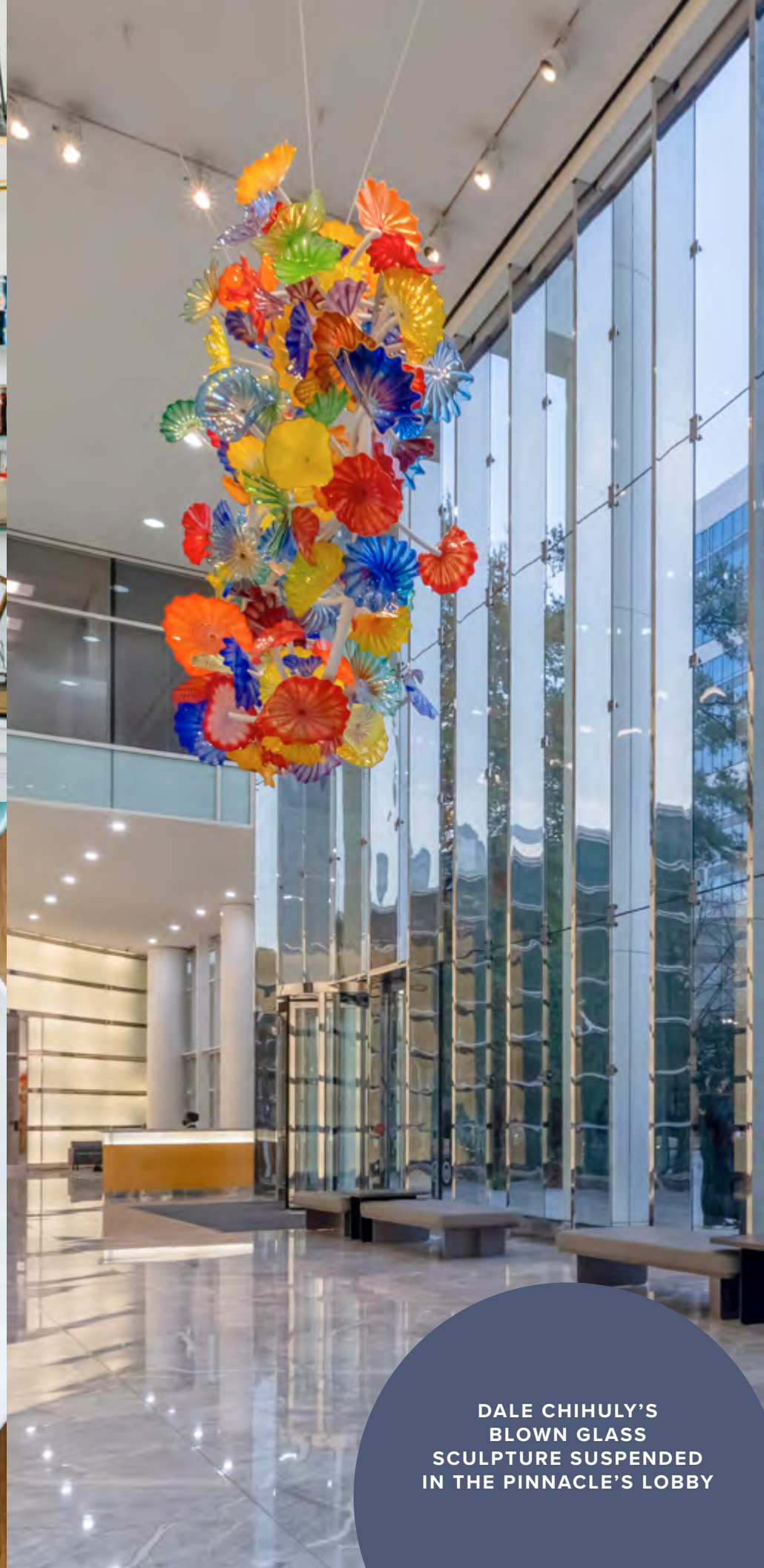
DALE CHIHULY'S BLOWN GLASS SCULPTURE SUSPENDED IN THE PINNACLE'S LOBBY